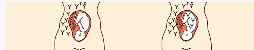
In the next pregnancy with an Rh (D) positive baby, the mother's antibodies may cross the placenta and destroy the baby's red blood cells.