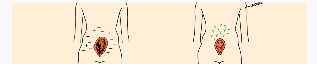
Rh (D) positive red blood cells from the baby enter the mother's bloodstream (usually at birth).

Legend: – Represents the mother's Rh (D) negative red blood cells. + Represents the baby's Rh (D) positive red blood cells. Y Represents Rh (D) immunoglobulin given by injection to remove Rh (D) positive red blood cells.